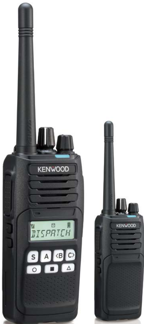
Standard Keypad model

If you are thinking of harnessing the latest digital protocols – NXDN or DMR – to enhance business efficiency or FM analog for its simplicity, the NX-1200/1300 has you covered. Our One-“K”-Fits-All solution offers the widest selection of two-way radios for everyday use. The model matrix also includes basic and keypad variations, with or without a high-contrast backlit LCD. Other features include a 7-color LED indicator and the popular KENWOOD 2-pin audio accessory connector. Plus, mixed-mode operation ensures seamless integration with legacy radios while smoothing the onward migration path to digital. But whatever your specific needs, audio quality is what determines clear voice communications – which is why KENWOOD radios are used under the most grueling conditions, like the cockpit of a racing car. Thanks to our extensive experience with professional systems, reliability is second to none. So whatever your radio requirements, KENWOOD’s NX-1200/1300 offers a single platform that’s right for you.